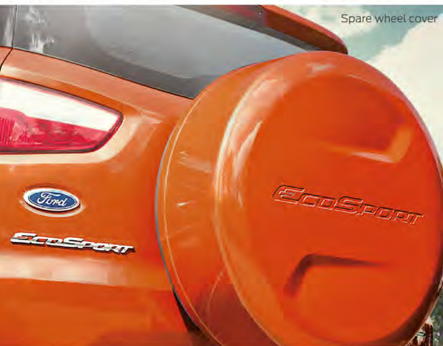
Spare wheel cover