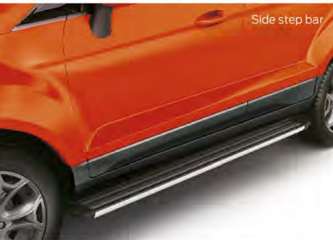
Side step bar