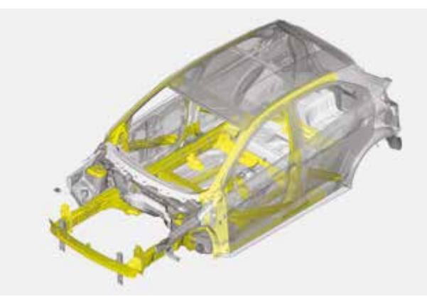
High-strength Steel Cage

The Anti-lock Braking System (ABS) with Electronic Brake Force Distribution (EBD) balances brake force between front and rear wheels and prevents them from locking. So you enjoy greater control and stability when you need to stop in a hurry.