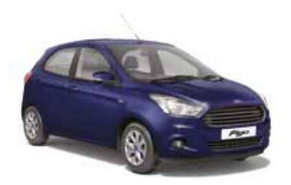
Deep Impact Blue